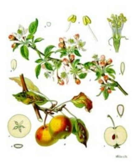
Apples from Koehler's Medicinal-Plants 1887. Public domain.

In a project a group of students is working on a short presentation about pollination of apples. For that, they are trying to find materials that they can use for a project webpage. They do not only want to collect hyperlinks, but want to re-use the materials.